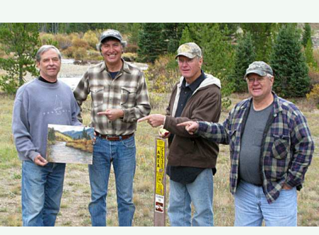
Endorsed by Experts

Keep an eye on my web site over the winter to see studio work done from studies made on this trip.